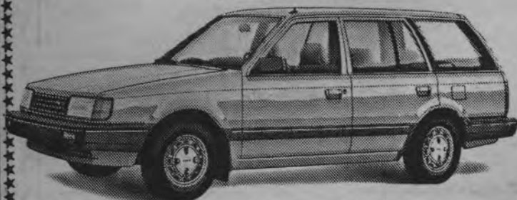
1987 MAZDA 323 STATION WAGON

$209.00* PER MO. SELLING PRICE $19158 DOWN PMT. $793.39 APR 11.9% 60 MO.