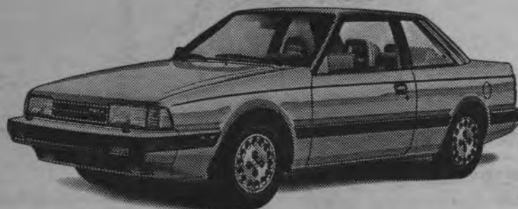
1987 MAZDA 626

$229.00* PER MO. SELLING PRICE $10900 DOWN PMT. $639.38 APR 11.9% 60 MO.