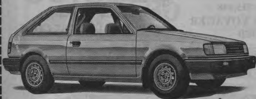
MAZDA B-2000 BASE