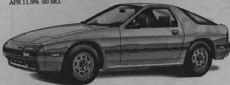
1987 MAZDA RX-7

$250.00* PER MO. SELLING PRICE $13800 DOWN PMT. $2598.23 APR 11.9% 60 MO.